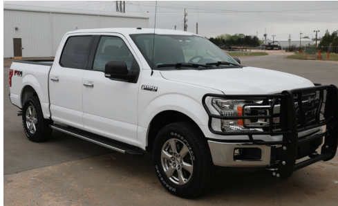
2018 Ford F150 XLT crew cab, V8 gas, 4X4 automatic, cloth interior, 127,700 miles. This truck is being sold "as is" with no warranty expressed or implied.

Sealed bids may be mailed to NWECC, PO Box 2707, Woodward, OK 73802 or dropped off at our Woodward office on 2925 Williams Avenue. Please write "2018 F150," or "2017 F550" on the front of the envelope. Bids will be accepted until 4 p.m. May 23rd. If you have any questions, please contact Randy at 580-256-7425. The trucks may be seen at 2925 Williams Avenue, Woodward, OK. NWECC reserves the right to reject any and all bids. NW