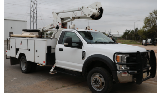
2017 Ford F550 XL regular cab, V10 gas, 4X4 automatic, cloth interior, 120,500 miles. Unit size ETC371H. This truck is being sold "as is" with no warranty expressed or implied. (19229001)